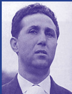
Ahmed Ben Bella

Ahmed Ben Bella is the legendary leader of the Algerian resistance to French colonialism. After the Liberation of Algeria, Ben Bella became the first President of Algeria.